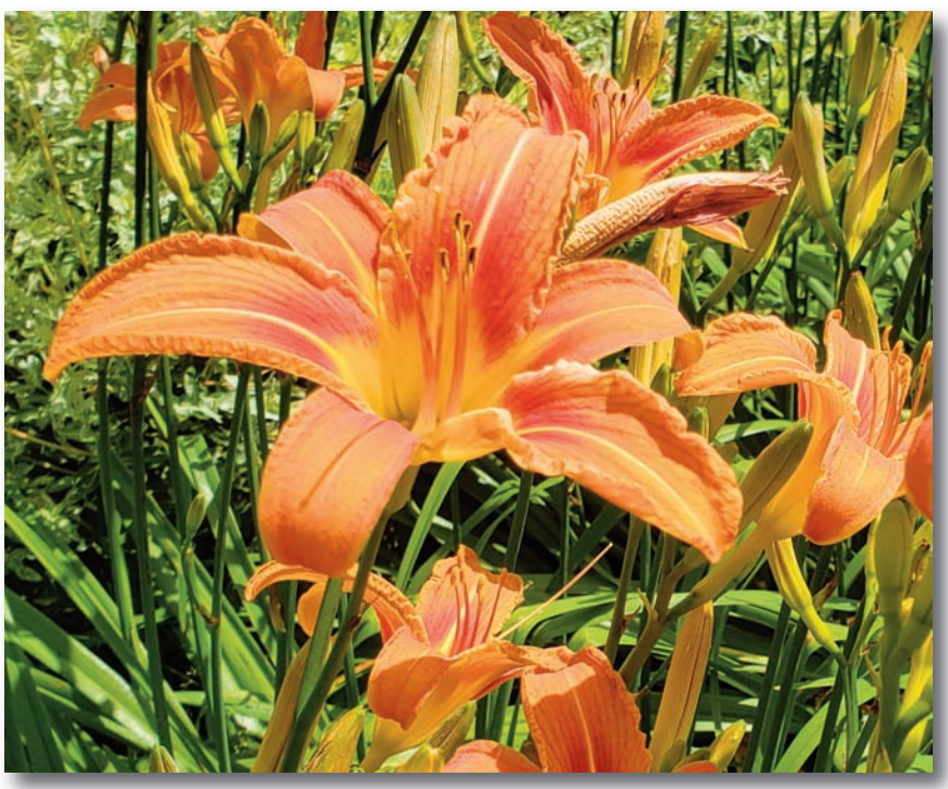
Lillies of Summer

1240 Old Sackville Road, Middle Sackville, NS • 865-3681 www.sackvillebaptist.ca Find us on YouTube